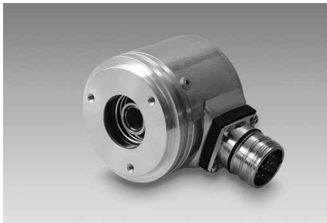
BHT with blind hollow shaft